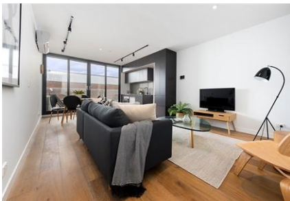
203/394 Lygon Street, Brunswick East Sold January 2018 - $395,500 Accommodation: 1 bed, 1 bath