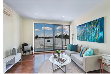
219/408 Lygon Street, Brunswick East Sold December 2017 - $390,000 Accommodation: 1 bed, 1 bath, 1 car