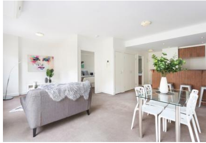
17/374 Lygon Street, Brunswick East Sold October 2017 - $390,000 Accommodation: 1 bed, 1 bath, 1 car