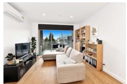
203/91-93 Nicholson St, Brunswick East Sold November 2017 - $426,000 Accommodation: 1 bed, 1 bath