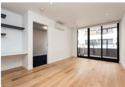
301/22 Barkly Street, Brunswick East Sold October 2017 - $407,000 Accommodation: 1 bed, 1 bath, 1 car