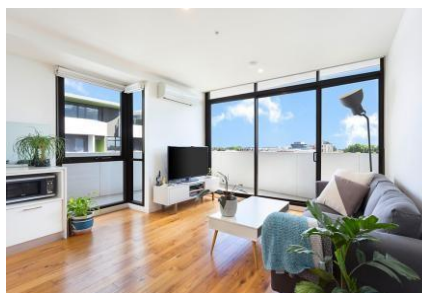
1401/176 Edward Street, Brunswick East Sold January 2018 - $410,000 Accommodation: 1 bed, 1 bath, 1 car