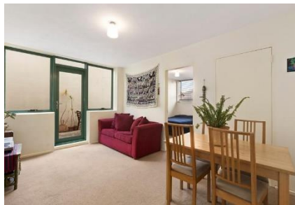
2/50a Brunswick Road, Brunswick East Sold September 2017 - $400,000 Accommodation: 1 bed, 1 bath, 1 car