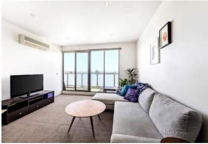
315/408 Lygon Street, Brunswick East Sold August 2017 - $380,000 Accommodation: 1 bed, 1 bath, 1 car