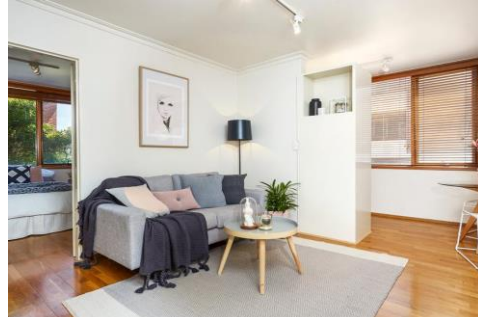
Comparable Property 10/106 Ascot Vale Road, Flemington Sold March 2017 - $257,500 Accommodation: 1 Bed / Bath / 1 Car