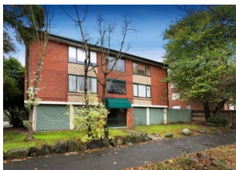
Comparable Property 9/106 Ascot Vale Road, Flemington Sold April 2017 - $292,000 Accommodation: 1 Bed / 1 Bath / 1 Car