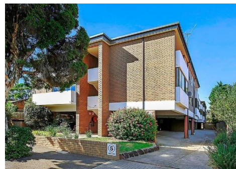
Comparable Property 3/171 Kent Street, Ascot Vale Sold May 2017 - $275,000 Accommodation: 1 Bed / 1 Bath / 1 Car