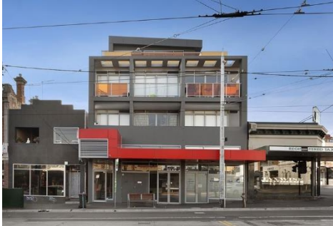
Comparable Property 7/110 Maribyrnong Road, Moonee Ponds Sold June 2017 - $222,000 Accommodation: 1 Bed / 1 Bath / 1 Car