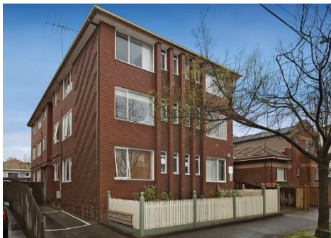
Comparable Property 4/84 Dover Street, Flemington Sold November 2016 - $265,000 Accommodation: 1 Bed / 1 Bath / 1 Car